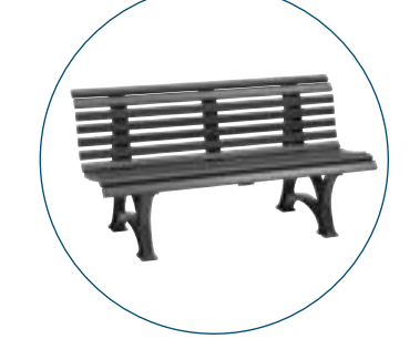
3-Seater Helgoland, graphite grey