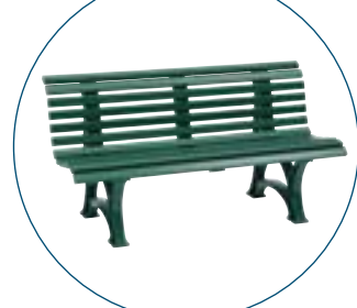
3-Seater Helgoland, moss green