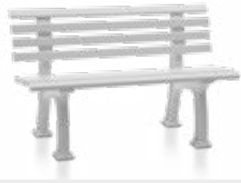
2-Seater Ibiza, apple green