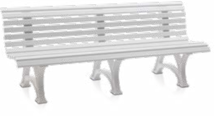
4-Seater Borkum, white