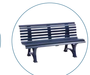
3-Seater Helgoland, steel blue